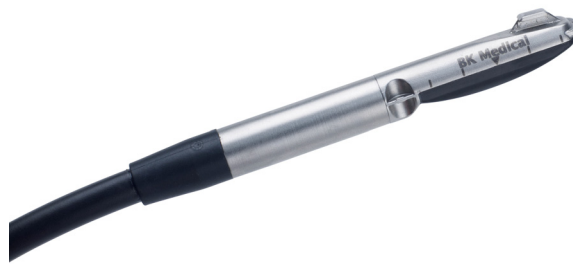
Figure 1. Pro ART Robotic Drop-in Transducer Type 8826.

The patient population is adults and children.