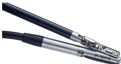
Figure 5. Grasping the transducer fin with the ProGrasp Forceps

Fig 5. illustrates how to grasp the transducer fin from the back of the transducer with the ProGrasp Forceps.