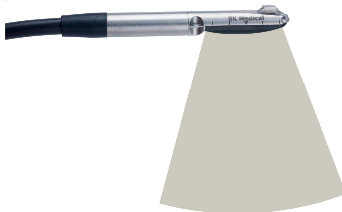
Figure 2. Imaging plane for Pro ART Robotic Drop-in Transducer Type 8826.

The 8826 is a small laparoscopic transducer with a curved array. The transducer has a penetration depth up to 125 mm (depending on system) and a 9 x 33.2 mm footprint size.