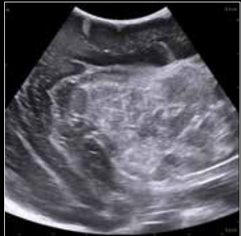
Large Brain Tumor being Evaluated during Surgery