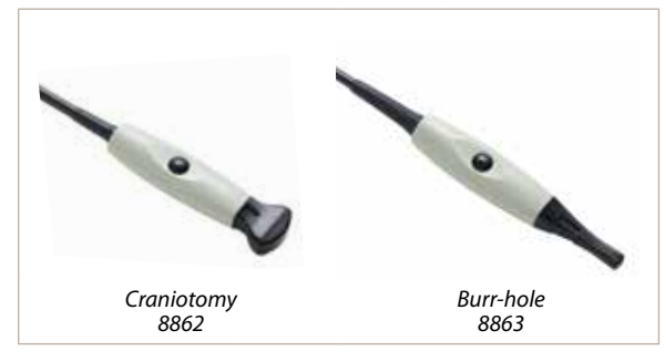
Neurosurgical Transducers Unmatched transducer accessibility and design for gold standard neuroimaging