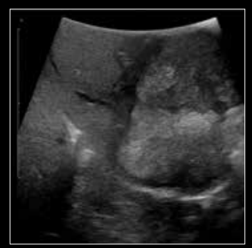
Metastatic Liver Lesions using T-shaped Intraoperative Transducer 8816