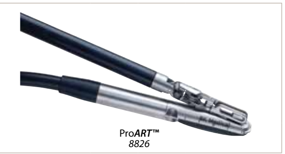
Robotic-Assisted Surgery Transducer Superb control, maneuverability, and optimal acoustic contact