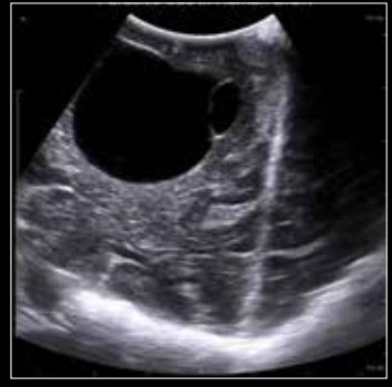
Parasitic Brain Cyst in Coronal Plane using Neurosurgical Transducer