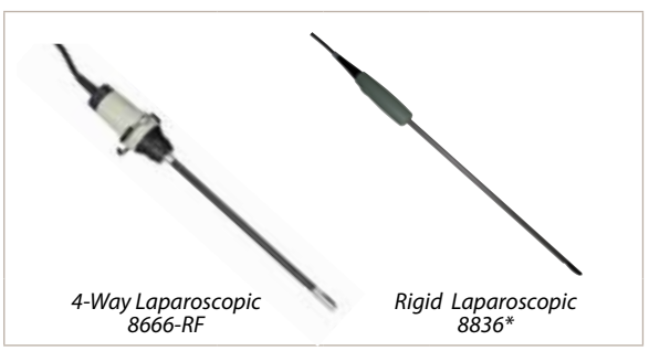
Laparoscopic Transducers Versatile transducers for the best laparoscopic imaging