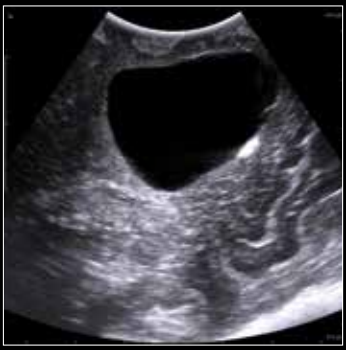
Parasitic Brain Cyst in Sagittal Plane using Neurosurgical Transducer