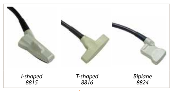
Intraoperative Transducers Comprehensive range of intraoperative transducers