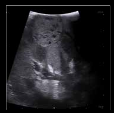
Renal Cell Carcinoma