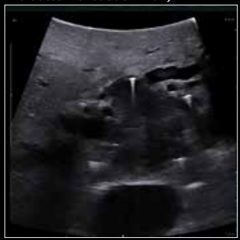
Biliary Hilar Tumor with Irreversible Electroporation Needles in Place for a NanoKnife® Procedure***