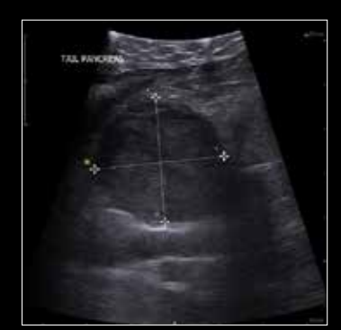
Pancreatic Head Shown with the 4-way Laparoscopic Transducer