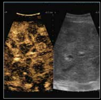
CEUS [Contrast Enhanced Ultrasound]<sup>**</sup> of Metastatic Liver Lesions being Evaluated Transabdominally