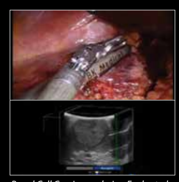
Renal Cell Carcinoma being Evaluated during RAPN Surgery using the ProART Transducer