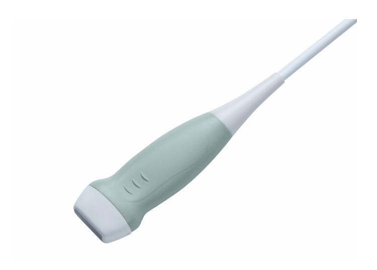
Figure 1. Small Footprint Cardiac Transducer Type 8837.

Small Footprint Cardiac Transducer Type 8837 is designed for basic cardiac examinations, abdominal imaging and transcranial imaging.